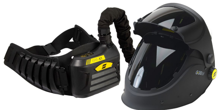
G30 Air with ESAB PAPR